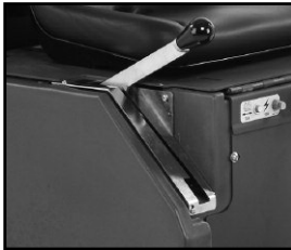
Mechanical deck lift lever