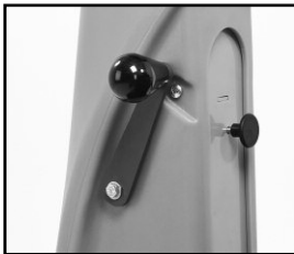
Mechanical squeegee lift lever located on steering column