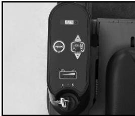
Simple one button control panel